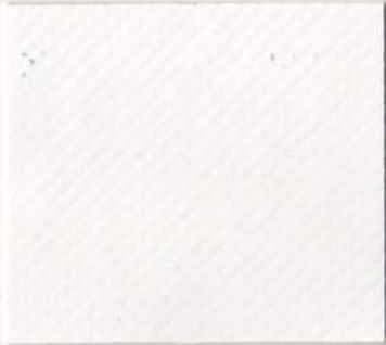
1F4 Traffic White