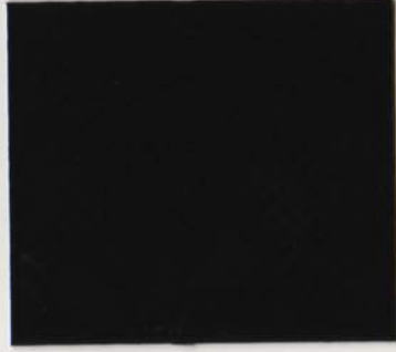
904 Jet Black