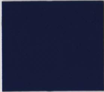
566 Cobalt Blue