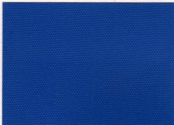
ROYAL BLUE 765412