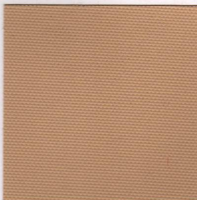
DESERT TAN 765449