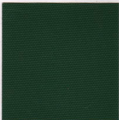
FOREST GREEN 765403