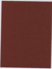
metallic | 38/60064 Pearl Copper