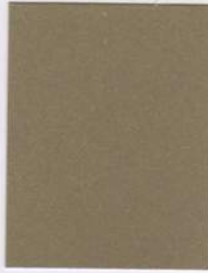
metallic | 38/15018 Champagne 302