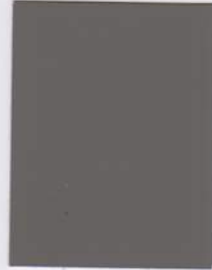
satin | 38/70019 Slate Grey gloss level 30±5