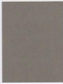
metallic | 38/90009 Argento 307