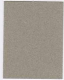
metallic | 38/15017 Champagne 301