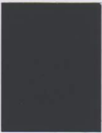
primer 69/90500 (USA and Mexico) 69/90701 (Canada) Zinc-Rich Primer | gloss level 70±5