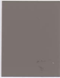
glossy | 38/70056 Grey Classic 310 gloss level 80-95