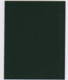
satin | 38/50110 Hartford Green gloss level 30±5