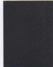
metallic | 38/90018 Argento 314