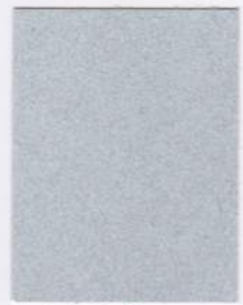
metallic | 38/90003 Argento 301