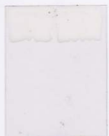
clear | 38/00001 Clear Glossy ❖ gloss level 85+