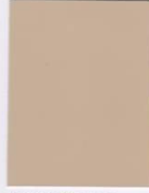
glossy | 38/15009 Creme 305 *** gloss level 80-95