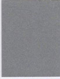
metallic | 38/91020 Anodized Silver