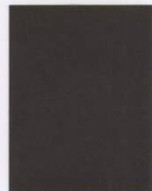
metallic | 38/60060 Medium Bronze

For visual inspection of RAL colors, please refer to the latest edition of "RAL colors, Interior and exterior applications" color chart from TIGER Drylac® .