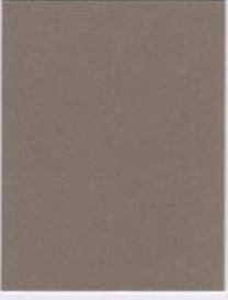
metallic | 38/15021 Champagne 304