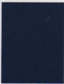
metallic | 38/40127 Pearl Night Blue