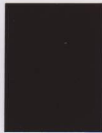
glossy | 38/60039 Marrone 308 gloss level 80-95