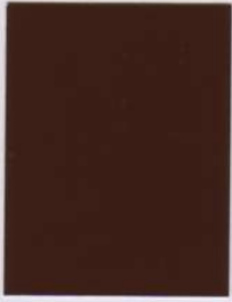
glossy | 38/60026 Marrone 306 gloss level 85±5