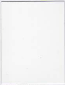
glossy | 38/10007 Bianco 302 *** gloss level 85±5