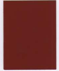
matte | 38/30028 Brick Red gloss level 20±5