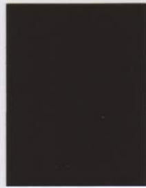
satin | 38/60080 Statuary Bronze gloss level 30±5