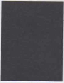
metallic | 38/90016 Argento 312