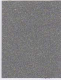
metallic | 38/99999 NEW Bengal Silver ***