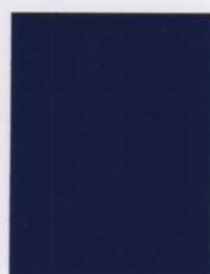
glossy | 38/40033 Azzurro 307 gloss level 85±5