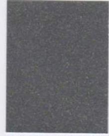
metallic | 38/90080 NEW Brilliant Sparkle Silver ** | ***