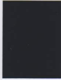
glossy | 38/70061 Grey Classic 314 gloss level 80-95