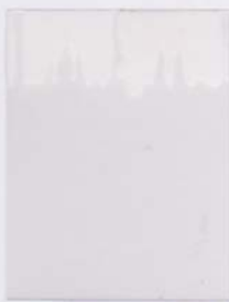
clear | 38/00088 NEW Clear Matte ❖ gloss level 10±5