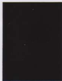
matte | 38/60090 Dark Anodized Bronze gloss level 20±5