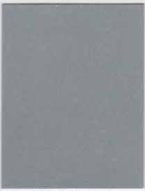
metallic | 38/90010 Marine Silver One Coat