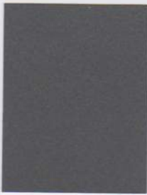
metallic | 38/90015 Pearl Dark Grey