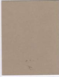
metallic | 38/15020 Champagne 303