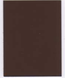
satin | 38/60018 Koko Brown gloss level 30±5