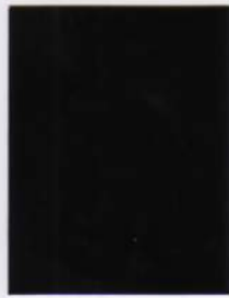
glossy | 38/80002 Carbon 301 gloss level 85±5