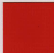
CBL2 BRIGHT RED 853302