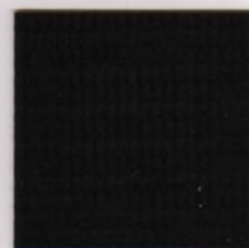
CBL10 BLACK 853310