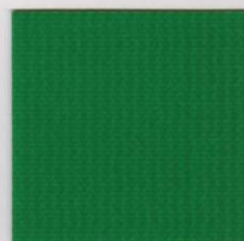
CBL7 EMERALD GREEN 853307