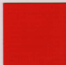
CBL1 CHERRY RED 853301