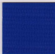
CBL6 ROYAL BLUE 853306