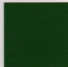
CBL21 HOLLY GREEN 853324