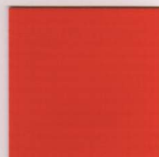
CBL17 TANGERINE 853317