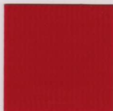
CBL19 RASPBERRY 853319