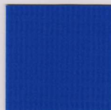
CBL16 INTENSE BLUE 853316