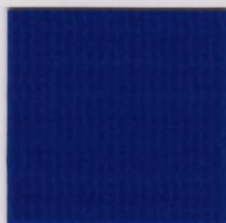
CBL5 NAVY BLUE 853305