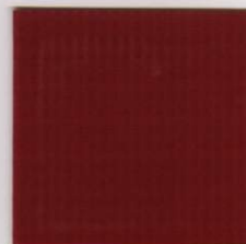
CBL22 BURGUNDY 853322