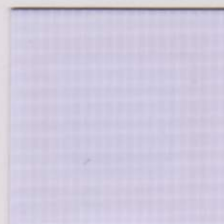
CBL WHITE *NO TOPCOAT* 853320

Lighter colors are more translucent than darker colors. Please hold the card up to the light to see how each color illuminates. Colors are representative only. Small variations in shade should be anticipated and are within commercial tolerances.