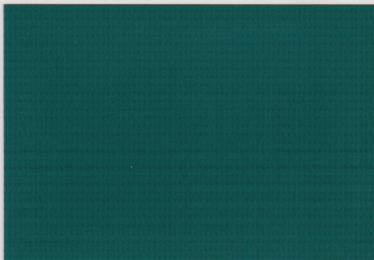
CBL13 TEAL 853313