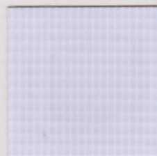
CBL0606 WHITE 853300