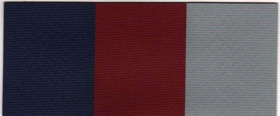
Navy Blue NT7747