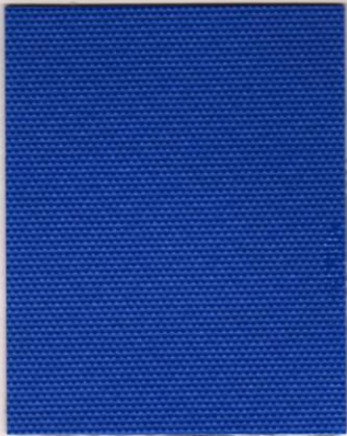
Coastal Blue NT7746