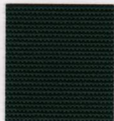
FOREST GREEN 839909