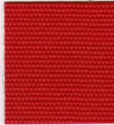
DARK RED 839908