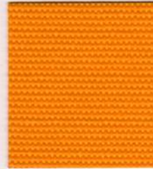
SUNFLOWER YELLOW 839911