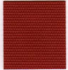
TERRA COTTA RED 839915